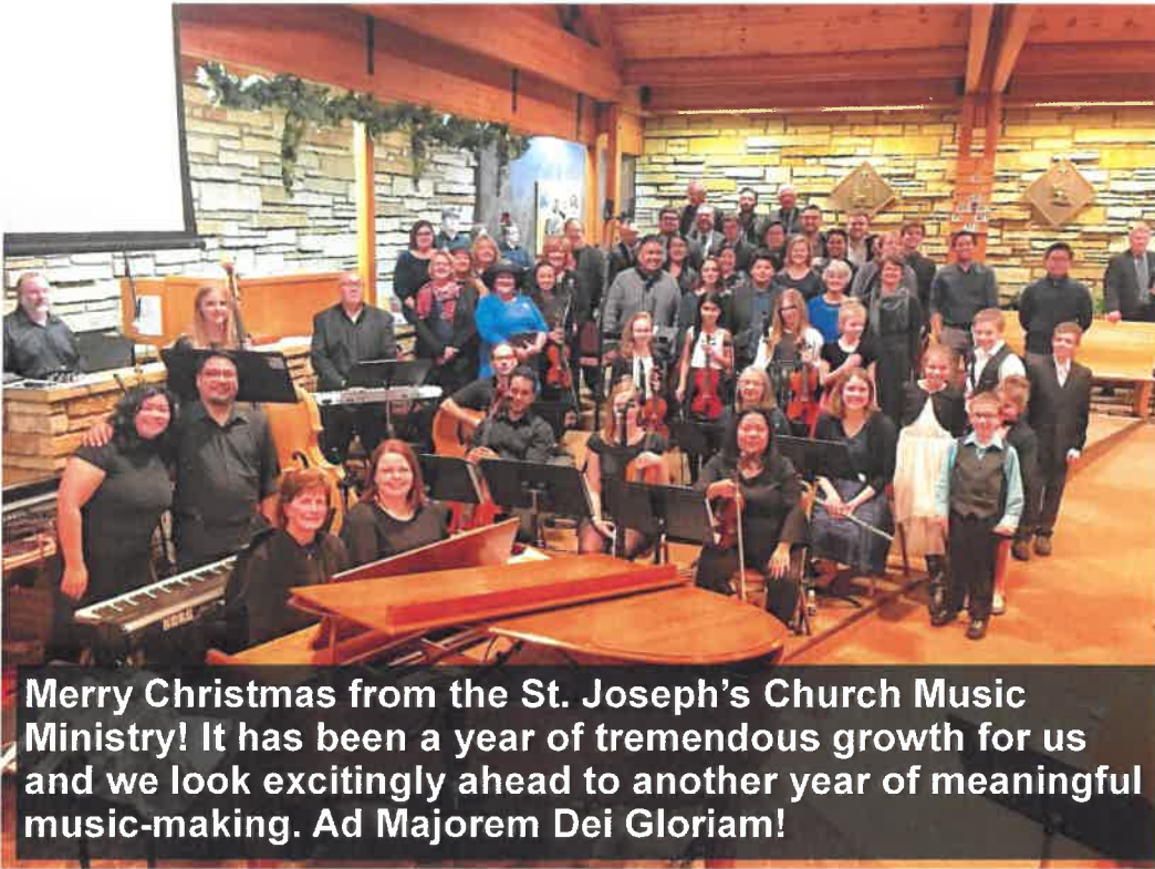
Merry Christmas from the St. Joseph's Church Music Ministry! It has been a year of tremendous growth for us and we look excitingly ahead to another year of meaningful music-making. Ad Majorem Dei Gloriam!

POSADA CHRISTMAS PARTY Monday December 23rd St. Joseph will have a Posada following the 2:00 PM Spanish Mass in the school gym. Everyone is invited to attend. Posada is Spanish for "lodging", or "accommodation". It is a Mexican tradition celebrating the anticipation of Jesus to be born. It involves singing specifically about the pregnancy of Mary carrying Baby Jesus, and their journey with Joseph to Bethlehem. The festivity will include a small reception.