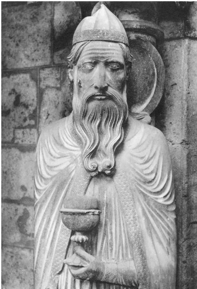
Statue of Melchizedek on the exterior of the Cathedral of Chartres, France, dating from the 15th century

“The once-for-all sacrifice of Jesus is re-presented every time we celebrate the Mass.”