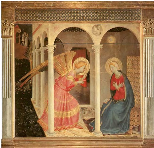
(Annunciation of Cortona by Fra Angelico)

The Annunciation of the Lord, also referred to as the Annunciation to Our Lady, is the Catholic celebration of the announcement by the angel Gabriel to the Virgin Mary that she would conceive and become the Mother of Jesus, the Son of God, marking his Incarnation.