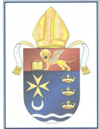
Crest of the Diocese of Venice.

The first parishes to receive a resident pastor were St. Francis Xavier, Fort Myers, in 1920; St. Martha, Sarasota, and St. Joseph, Bradenton, in 1927; and St. Paul, Arcadia, in 1929.