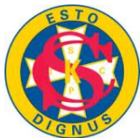
Knights of Columbus Squires Youth Organization