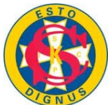
Knights of Columbus Squires Youth Organization