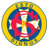
Knights of Columbus Squires Youth Organization