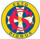
Knights of Columbus Squires Youth Organization