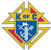
Knights of Columbus Insurance Your Shield for Life