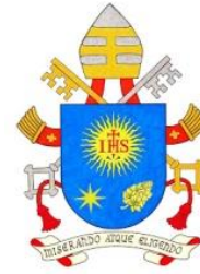
Pope Francis Vatican City State