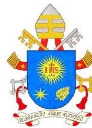
Pope Francis Vatican City State

Sacrament of Reconciliation Saturday 4:30-5:30 p.m. Wednesday 6:00-6:30 p.m. First Friday 4:00-5:30 p.m.