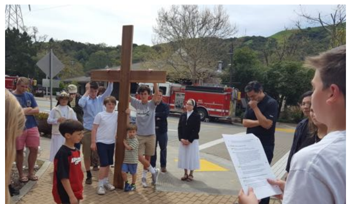
Young families joined us on our Good Friday Way of the Cross through Orinda to Orinda Senior Village and back for the liturgy