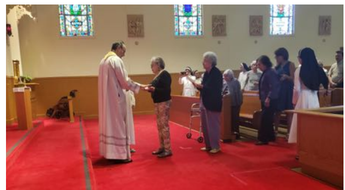
There were two liturgies with the Anointing of the Sick where we prayed over and anointed those who needed prayers of healing