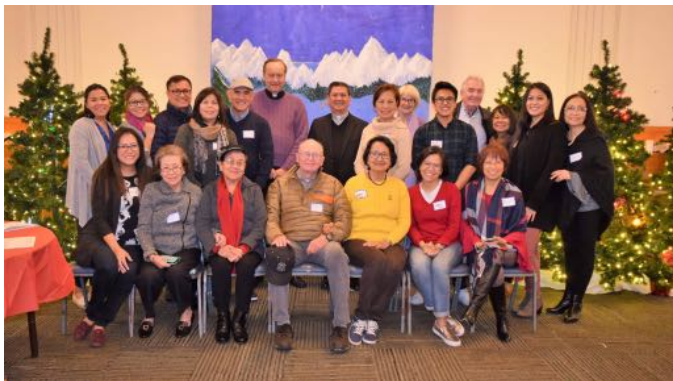
The Santa Maria Fil-Am Community forms and hosts socials and communal faith events like a Christmas potluck (above) and the Feast of Santo Niño in January