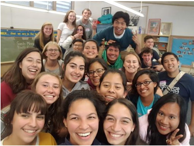
Our "Faith in Action Team" of Youth Ministry teens hosted a summer leadership retreat with other local Catholic teens