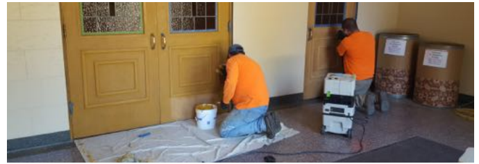
The Church gets improvements of new, expanded confessionals and refinished doors, among other things