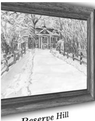
Reserve Hill Winter